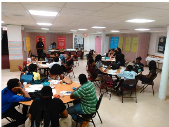
Youth participants attend an Advancing Youth Development (AYD) Workshop.

—Youth visited the Maryland Science Center. They enjoyed interactive and hands-on exhibits. They participated in live science shows and pop up science activities where they got to use their own knowledge to predict outcomes. They enjoyed going to the Davis Planetarium and seeing One World One Sky: Big Bird's Adventure which follows Sesame Street's Big Bird and Elmo as they explore the night sky with Hu Hu Zhu, a Muppet from China. Together, they take an imaginary trip from Sesame Street to the moon, where they discover how different it is from Earth.