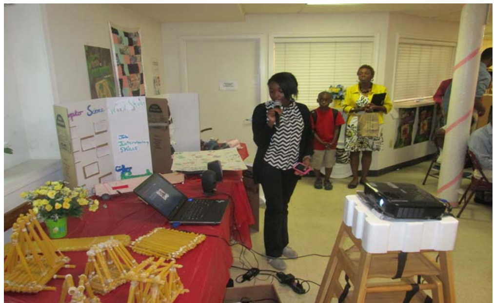
A student explains the 4 key components for work readiness - Creativity, Cooperation, Collaboration and Critical thinking .

All participants enjoyed learning activities that included science, technology, engineering, and mathematics (STEM). Field trips and social interactions provided real world experiences and fun for the students.